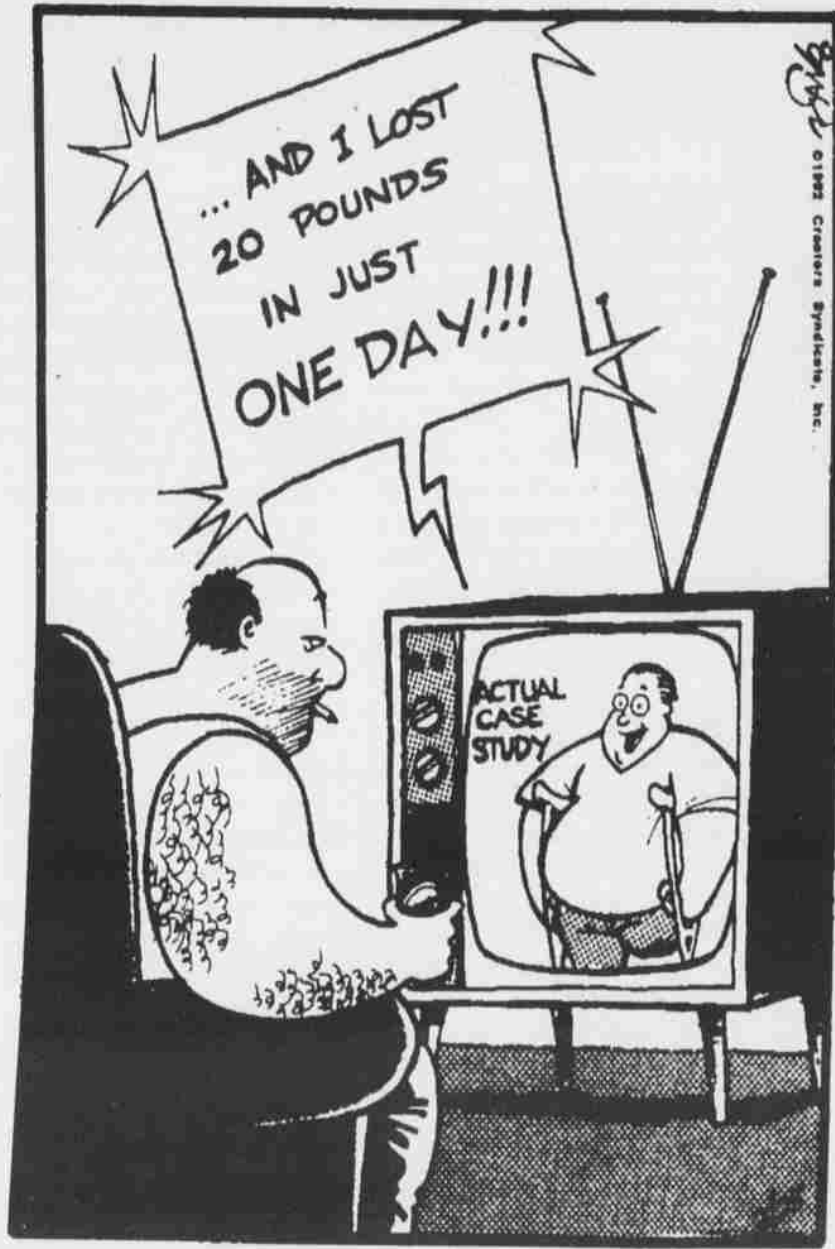
The Amputation Diet Plan

MISERY LOVES COMEDY • BY IVAN BRUNETTI ©1992