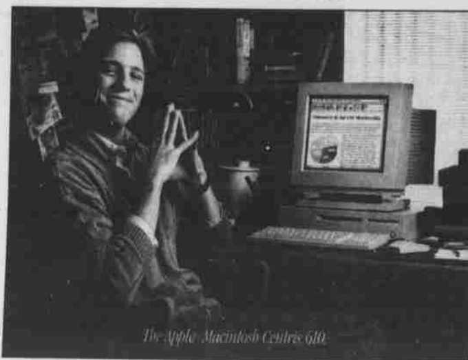
The Apple Macintosh Centris 610.