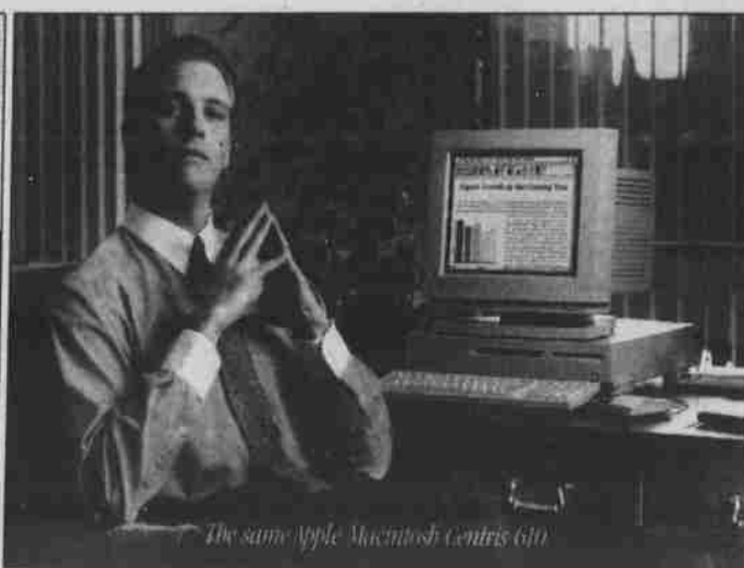
The same Apple Macintosh Centris 610.

The new Macintosh Centris™ 610 computer has all the power you'll need today – and tomorrow. Its 68040 chip speeds through word processing, spreadsheet and graphics programs. It's expandable up to 68MB of RAM, giving you lots of room to grow. And, Macintosh® is the most compatible