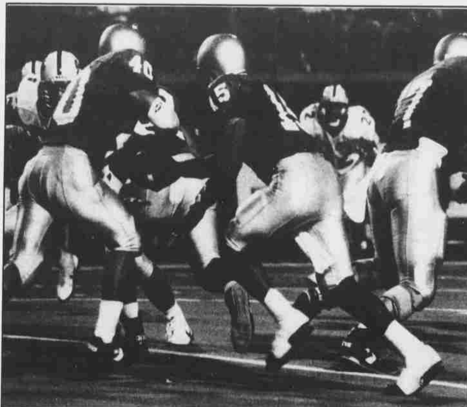
The Rebel Yell

The Nevada-Reno Wolf Pack return 10 starters, five offensive and five defen-