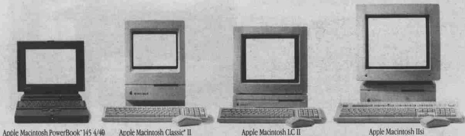
Apple Macintosh PowerBook 145 4/40