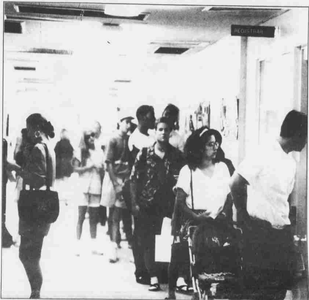
Students play the waiting game during late registration last week.