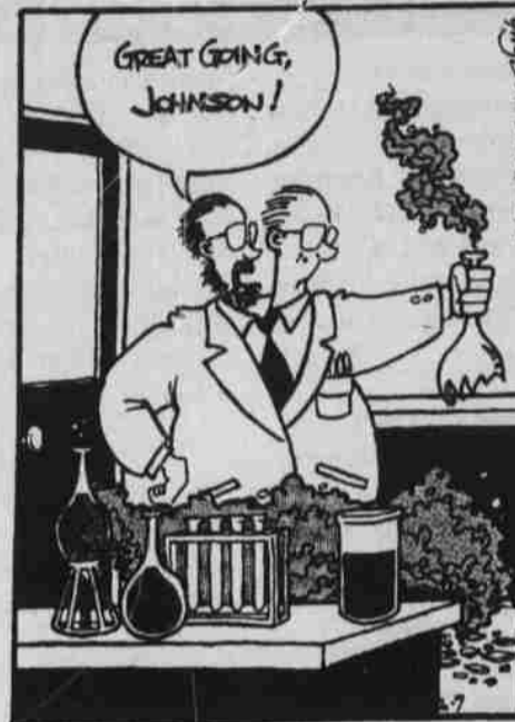
One of the dangers of working with fusion.

Note: this is an artist rendering and not actual photos of the DJ.