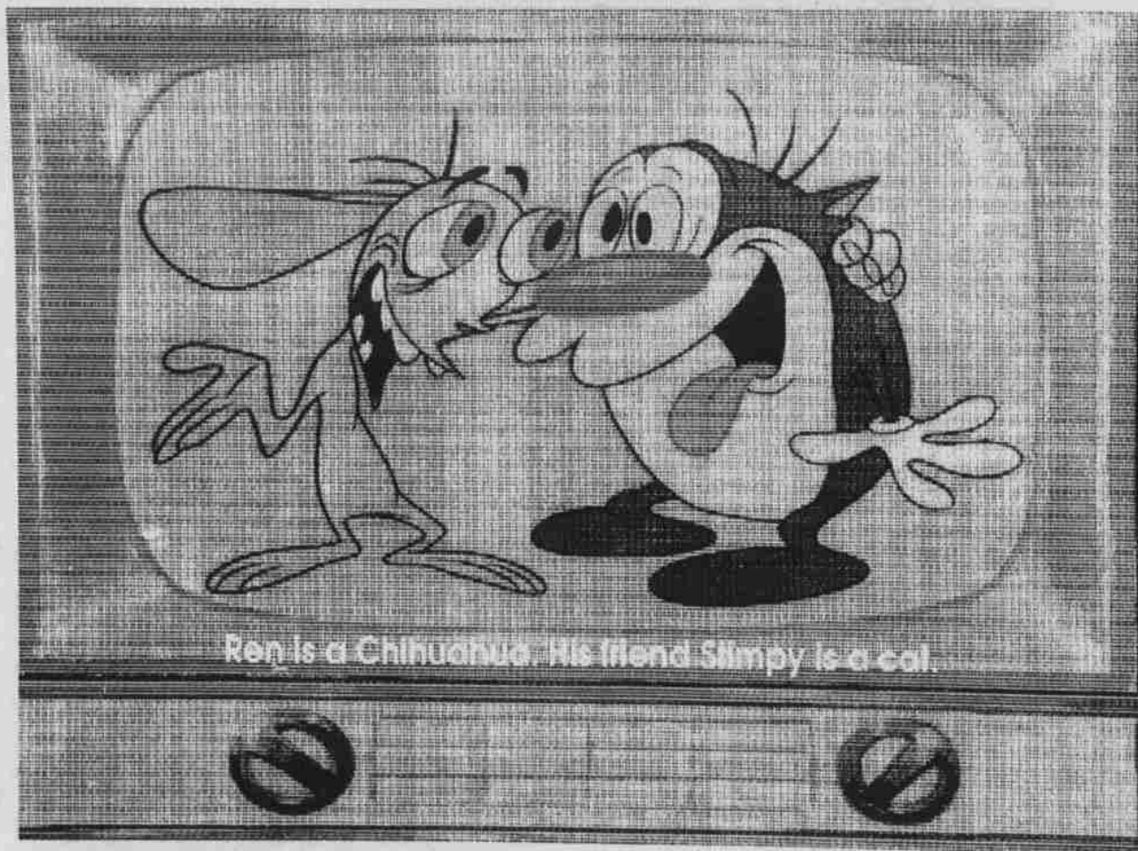
Ren is a Chihuahua. His friend Stimpy is a cat.