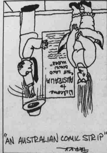
"AN AUSTRALIAN COMIC STRIP"