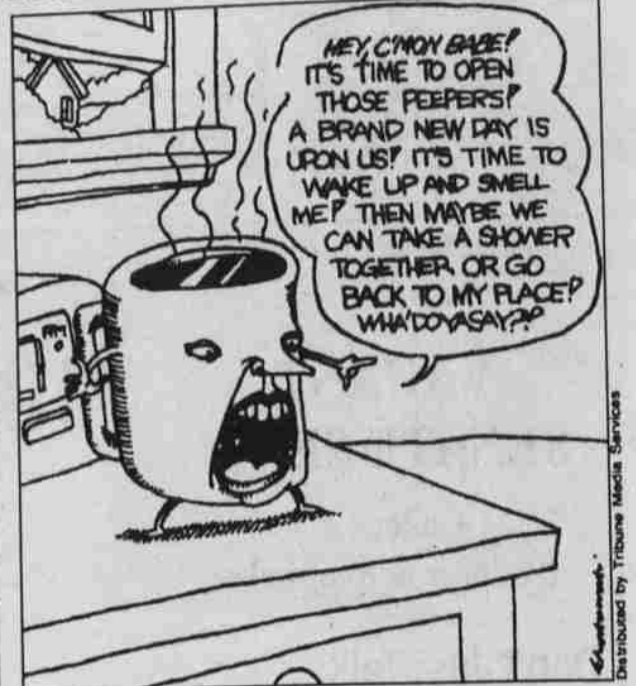
WHAT IT'S LIKE TO WAKE UP TO A FRESH CUP OF COFFEE...