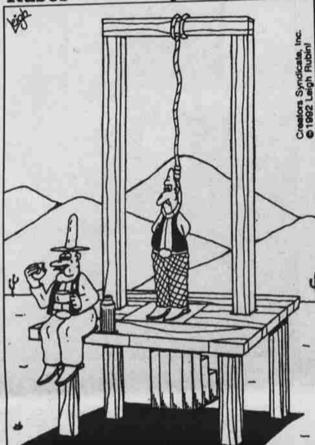
Coffee break during the swing shift.

Creators Syndicate, Inc. © 1992 Leigh Rubin