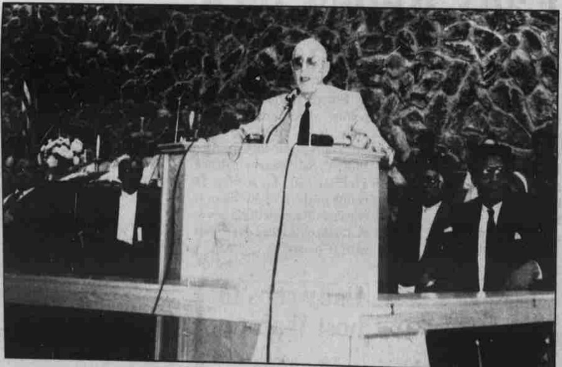
Rebel basketball Coach Jerry Tarkanian announces Sunday that he will rescind his resignation.