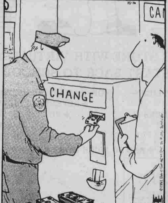
Testing new dollar bills at the Treasury's Quality Control Division.