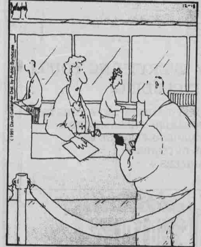
"Sir, if you'll just fill out this hold-up form, I'll be with you in a moment.