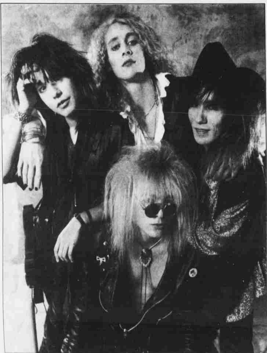
Bang Kittli Bang try to establish themselves as a glam band to be reckoned with.

They are a definite enigma on the local music scene and should be caught in action their "second time around." The group is just using Las Vegas as a spring board to the Los Angeles rock scene and hopes to solidify their act along with a following before they depart.