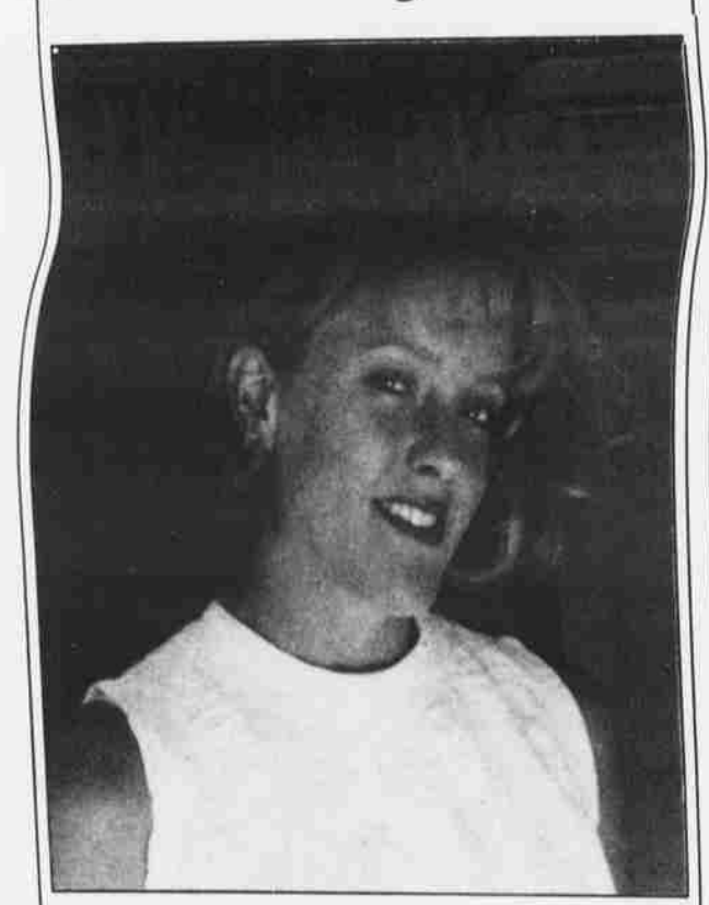
June 23, 1973 to November 12, 1991