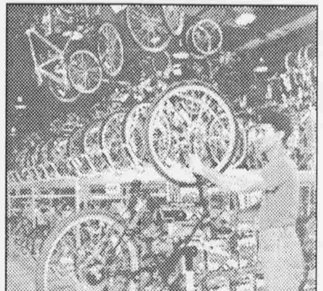
Our huge bicycle selection includes top name brands and accessories. Complete bicycle assembly is available in each of our locations.