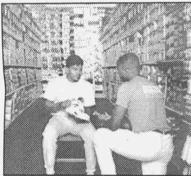
Over 10,000 pairs of shoes in 500 different styles including basketball, aerobic, tennis, golf, cleats, running, walking, hiking, crosstraining and more!