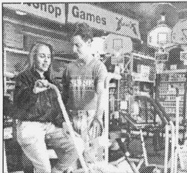
Stairsteppers, weights, treadmills, bicycles..... Everything you need to get fit and stay fit in our Exercise and Fitness department.