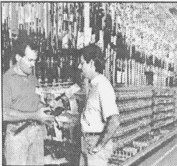
The outdoorsman can find everything here from rods and reels to tents, sleeping bags and hunting gear.