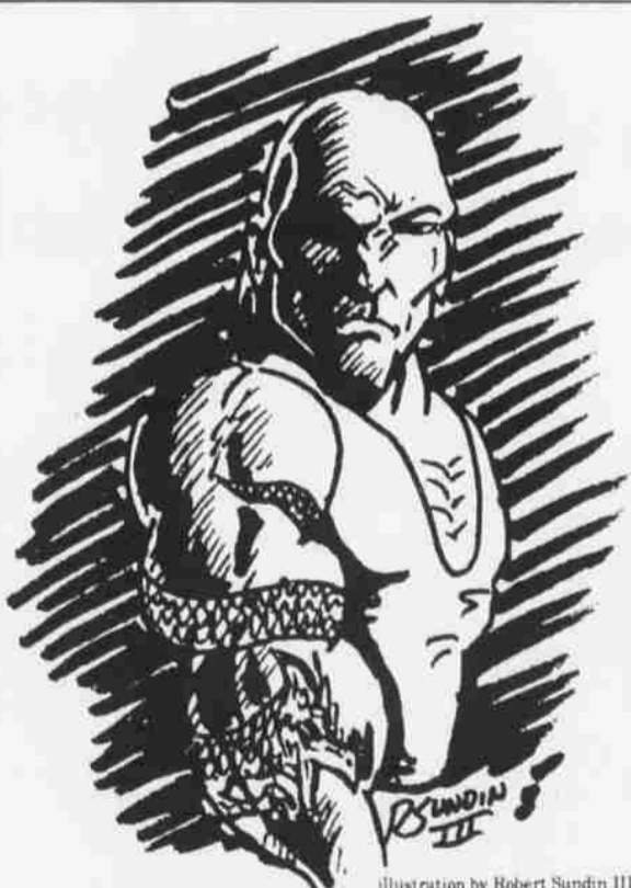
Illustration by Robert Sundin III

When getting a tattoo, keep in mind that if you don't like it you must either suffer or go to a doctor and have it surgically removed with a laser. Tattoo shops are not allowed to remove them, but are allowed to cover them up with another tattoo of more intricate design.