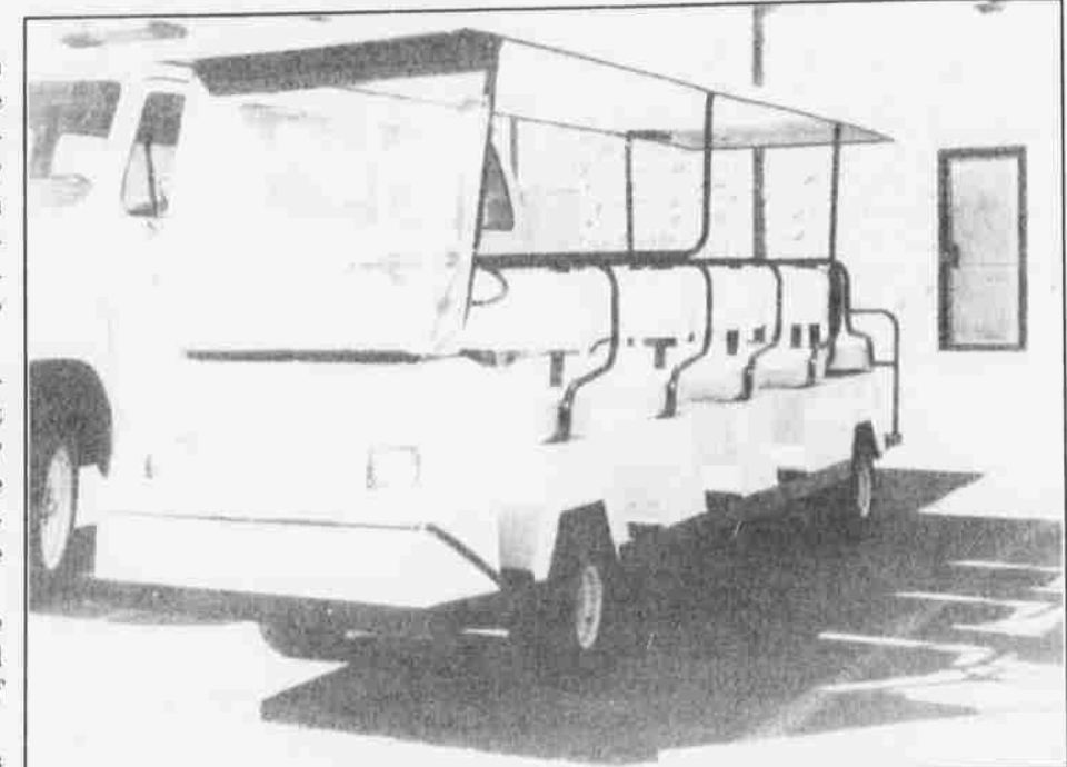
The new UNLV shuttles will run Monday through Thursday from 6:30 a.m. to midnight.