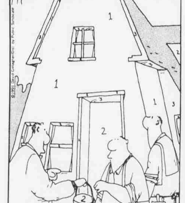
"All right, you morons — no mistakes this time."