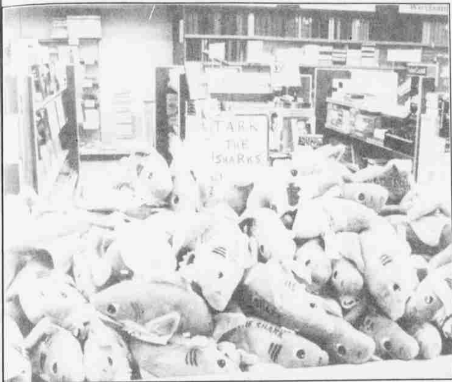
Just a few of Tark's most staunch supporters.