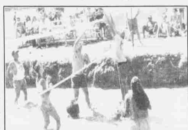
Oozeball participants have a little fun in the mud.

The tournament was they were excited by the because of the number of Campus turnout. The players said teams, spectators and the Intramurals, could be heard play.