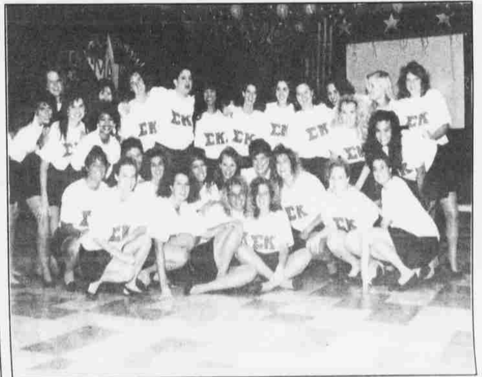
Members of UNLV's Sigma Kappa sorority.