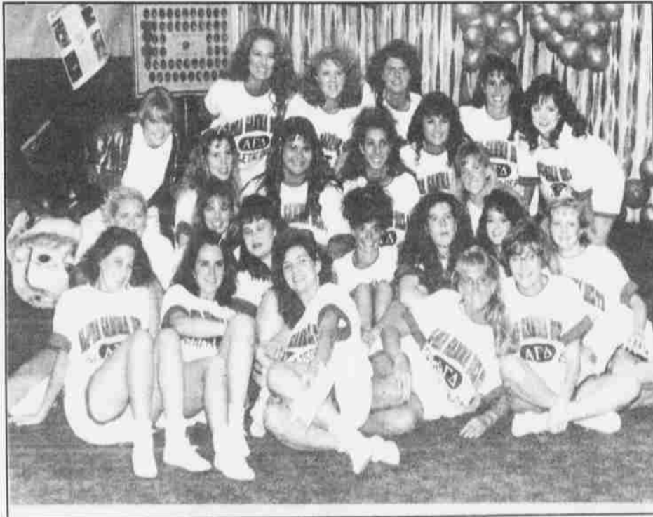
The sisters of UNLV's Alpha Gamma Delta sorority.