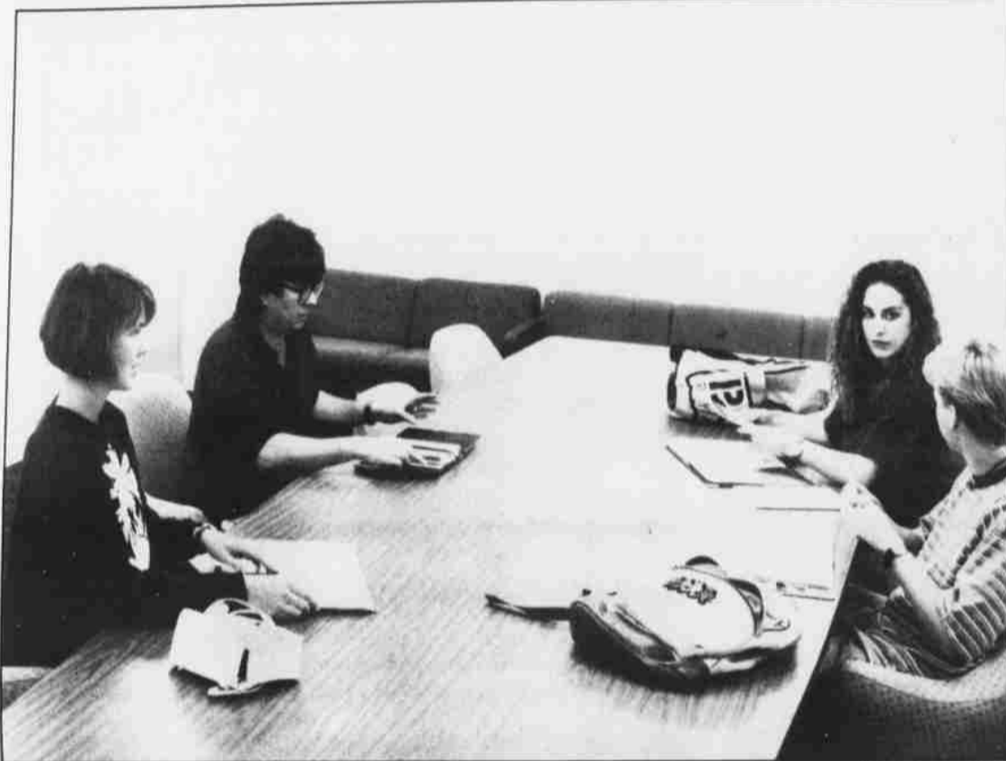
Ad club Exec Board members make plans for next year.