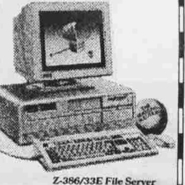
Z-386/33E File Server

80386 33 Mhz Processor EISA Standard - Great File Server!! 4 Mb RAM Expandable To 16 Mb 16K Memory Cache - 32 Bit I/O DOS 4.0 and Windows 3.0 Built In Zenith's Flat Technology Monitor Included Zenith's Total Care Warranty Built In!! $5,999 150 MB $6,699 320 MB