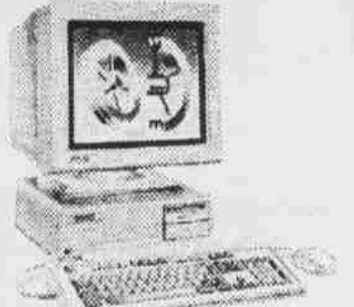
Z-286 LP Plus

80286 12 Mhz Processor 20 Mb or 40 Mb Hard Disk DOS 4.0 and Windows 3.0 Built In Microsoft Mouse Included Zenith's Flat Technology Monitor Included Zenith's Total Care Warranty Built In!! $1,699 20 MB $1,799 40 MB