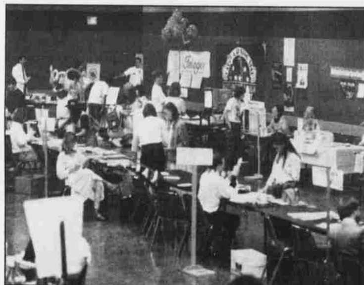
Students check out exhibits for Health Awareness Day.

The overall assessment of Health Awareness Day was very positive according to the majority that attended. It seemed to draw many students who left with more information about certain topics of interest, as well as some help and support that they might have been looking for.