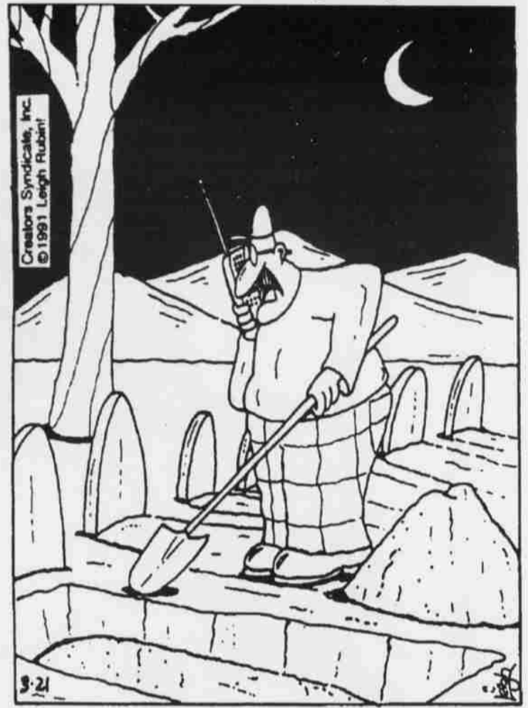
"I'm afraid Phil's out sick today... I'm just filling in for him."