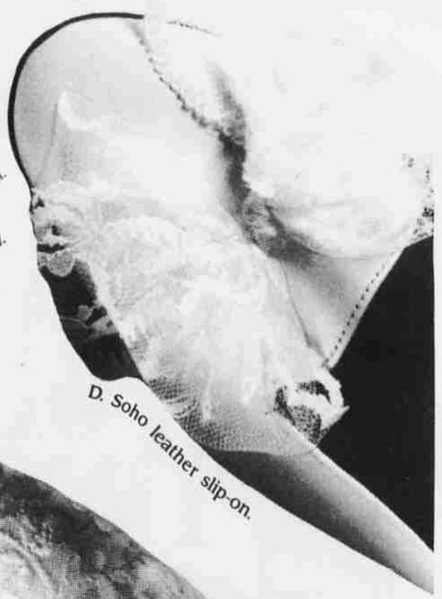
D. Soho leather slip-on.