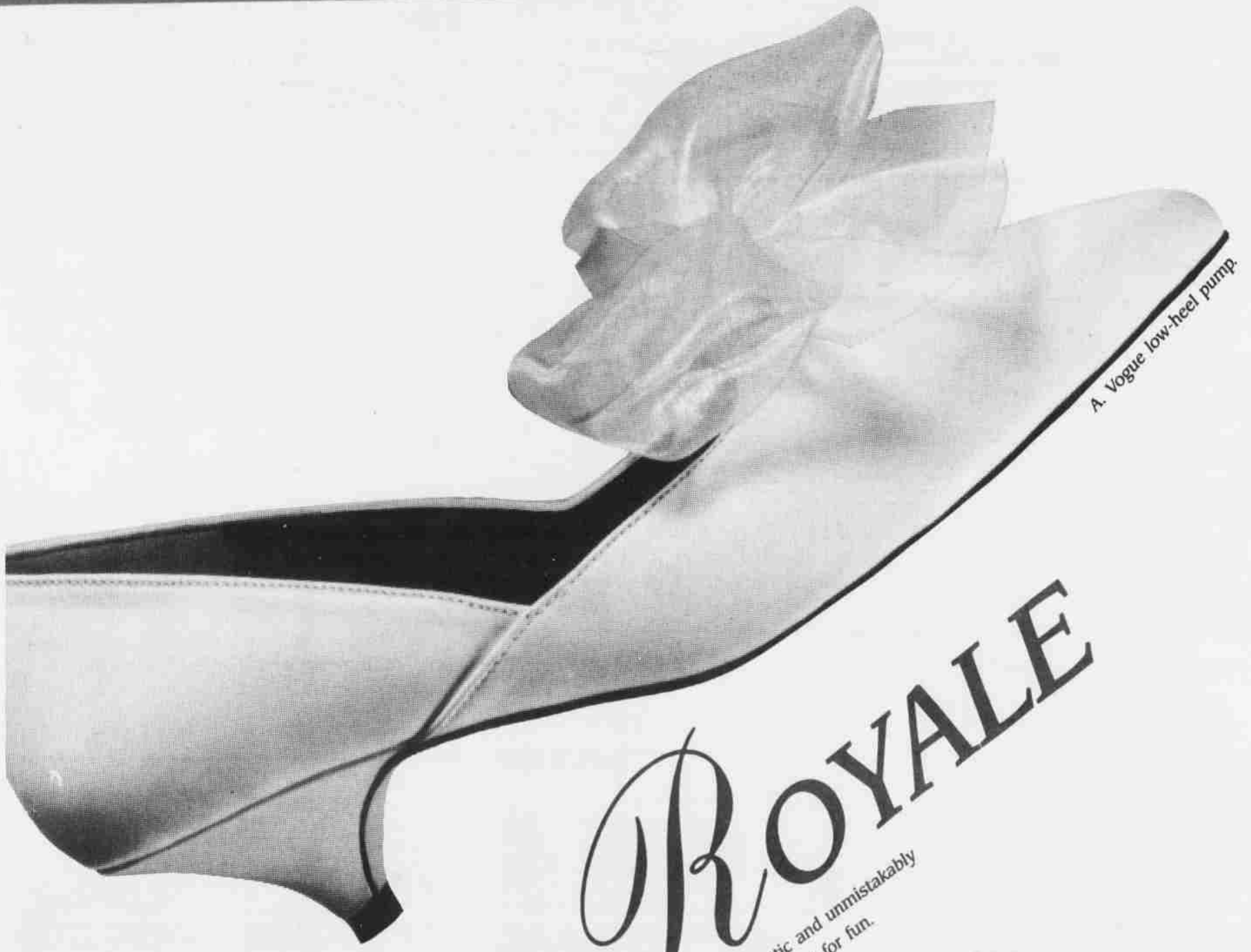
A. Vogue low-heel pump.