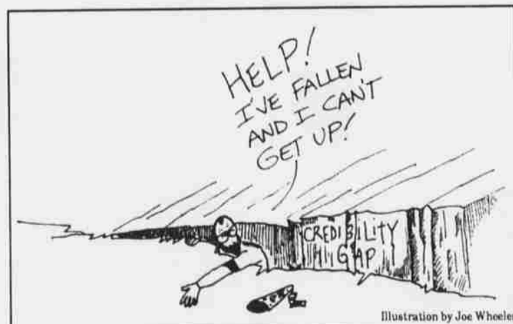
Illustration by Joe Wheeler

To accommodate as many letters as possible, The Yellin' Rebel reserves the right to edit all letters for space and clarity.