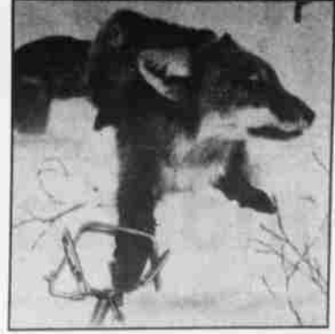
Canada and the U.S. are among the nations that haven't outlawed the steel-jaw leghold trap.

life. The Nevada Humane Society-said. RENO, and the Sierra Club. Alattempt to preserve and protect more information.