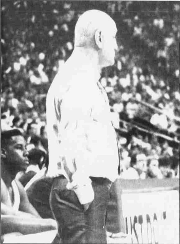
Coach Tarkanian's Rebels face their biggest challenge this Sunday.