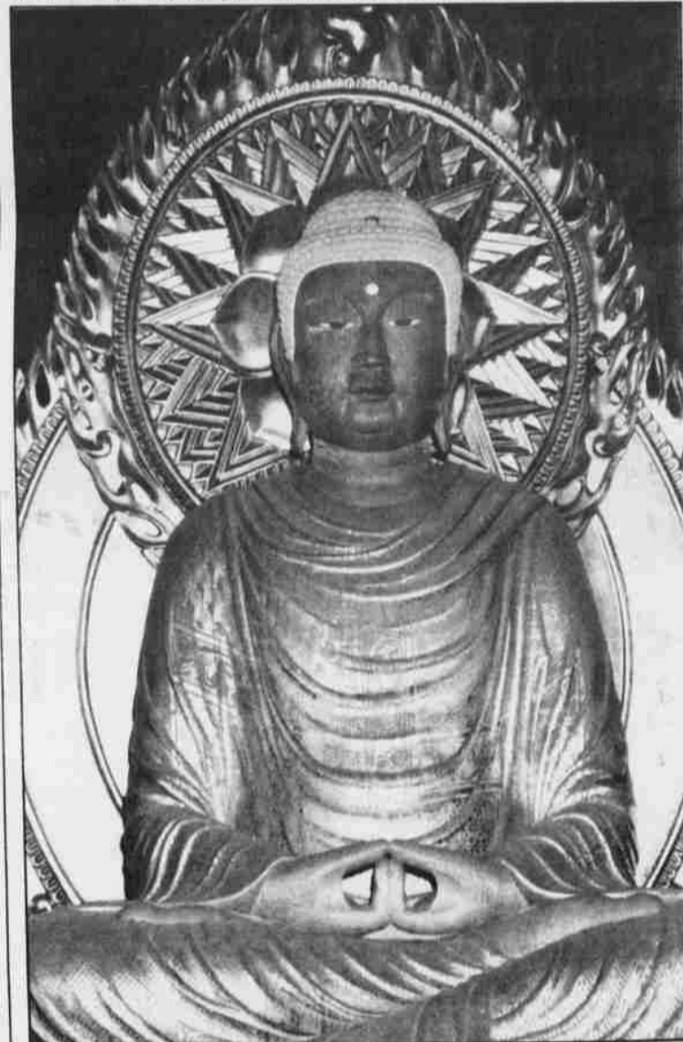
Every day in a foreign country offers something new and fascinating.

The entire delegation was well received by their hosts and many new friendships and professional relationships will continue into the future. Hopefully, with other delegations such as this one, we can combat this disease and many others in the world.