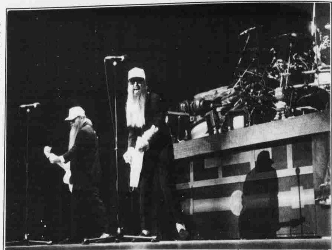
ZZ Top - The Texas trio slammed out new and old tunes during their recent Las Vegas concert.

Dressed Man" and "A Fool For album included "Confidence