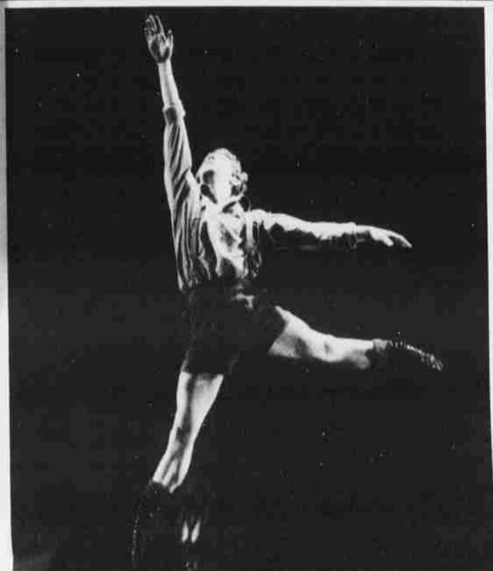
"Tell Me A Tale", the Royal New Zealand Ballet

Nevada Dance Theatre will present The Royal New Zealand Ballet as a gala benefit Nov. 15, at 8 p.m. in UNLV's Artemus W. Ham Concert Hall. The Royal New Zealand Ballet, one of four ballets in the world bestowed with the title "Royal" by Her Majesty Queen Elizabeth II of Great Britain, brings to America over 40 artists performing a distinctive program of contemporary and classic ballet. The 37-year-old company will present a full evening of works including "Faust Divertissement," "Sweet Sorrow," "Tell Me A Tale," and "Le Beau Danube." Tickets for The Royal New Zealand Ballet can be purchased by calling the UNLV Performing Arts Box Office, 739-3801.