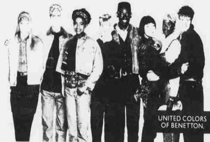
UNITED COLORS OF BENETTON.