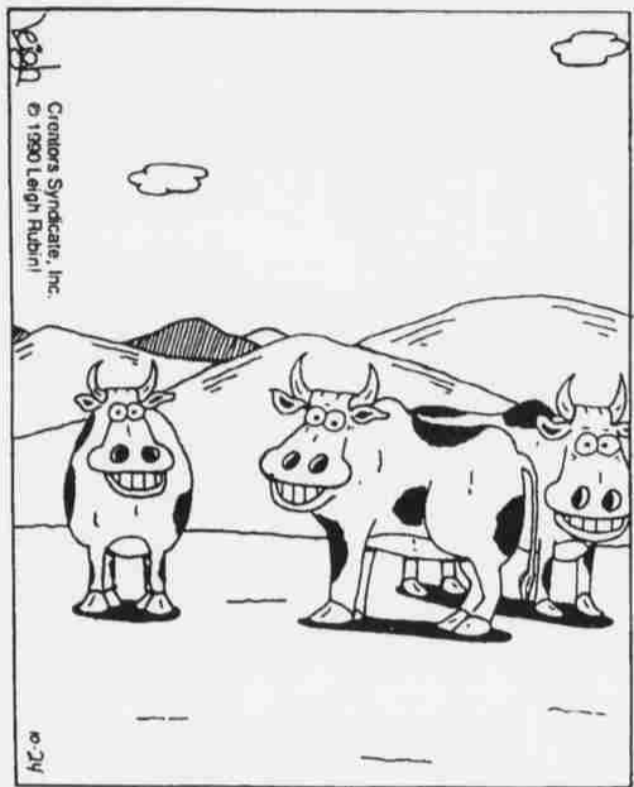
The special breed raised exclusively for McDonald's Happy Meal.