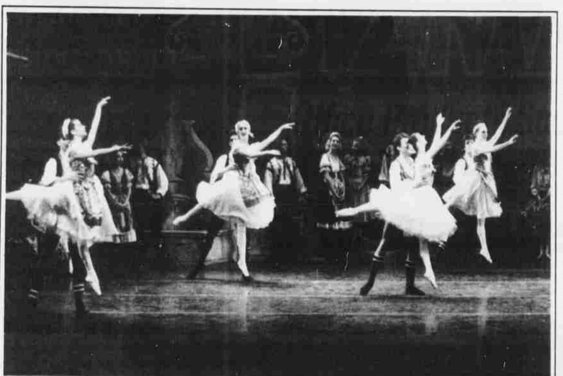
Opening night - The Nevada Dance Theater performs "Coppelia" for the opening of their 1990-

18-21, 1990. The production will and they live happily ever after. be performed at UNLV's Judy Bayley Theatre.