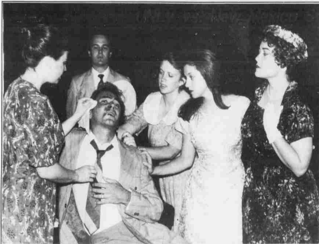
Practicing - Cast and director rehearse for UNLV's presentation of "Toys in the Attic"