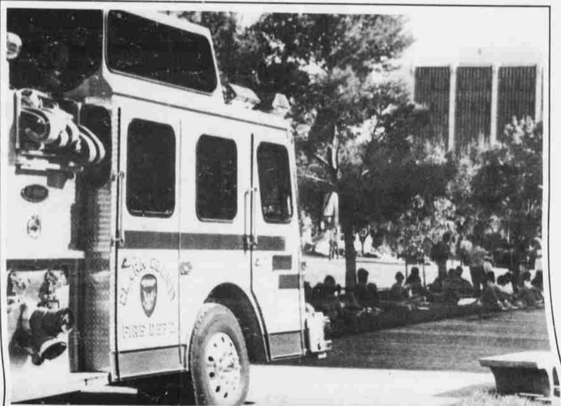
False alarm- It was a nice day for a false alarm recently at the James Dickinson Library.

Police said they will not be investigating further.