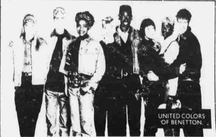
UNITED COLORS OF BENETTON.