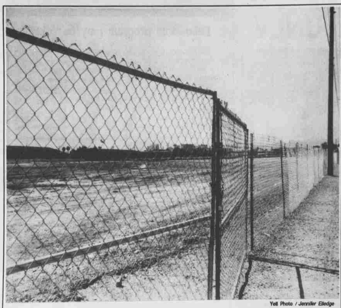
New field - Construction on the new six acre Intramural field to be completed by the spring of 1991.