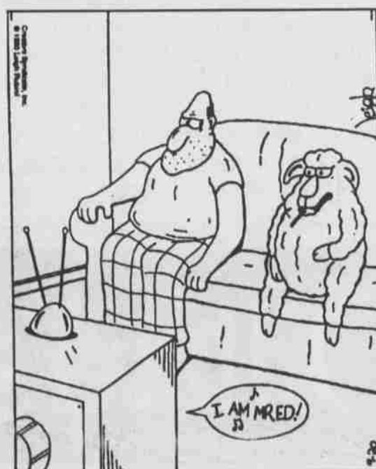
"Imagine, a show about a talking horse... how unrealistic!"