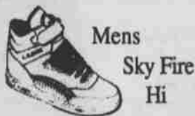
Mens Sky Fire Hi