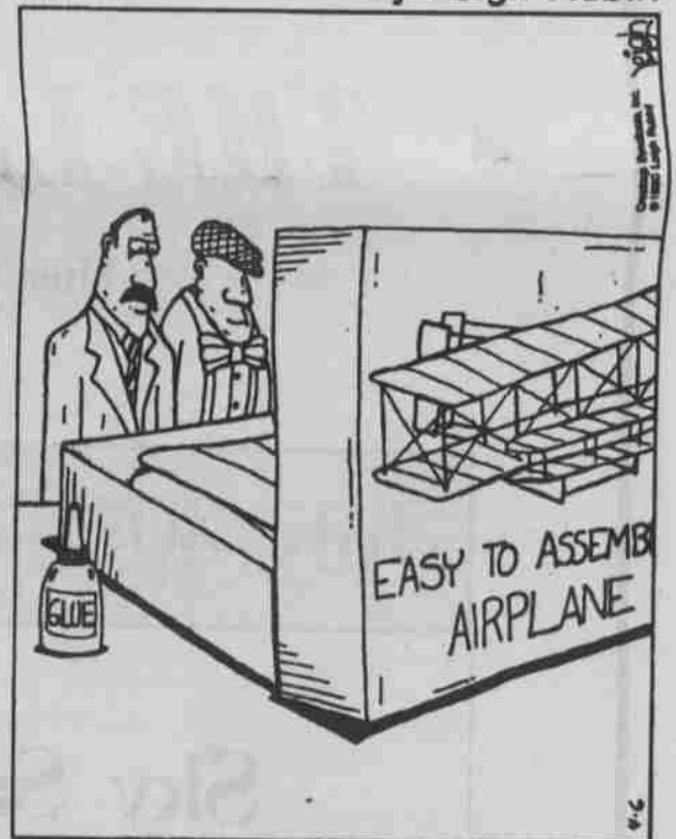
How the Wright brothers really did it.