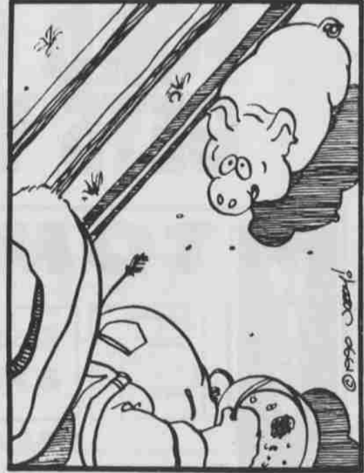
Oh, anything's fine. I'm not a fussy eater.