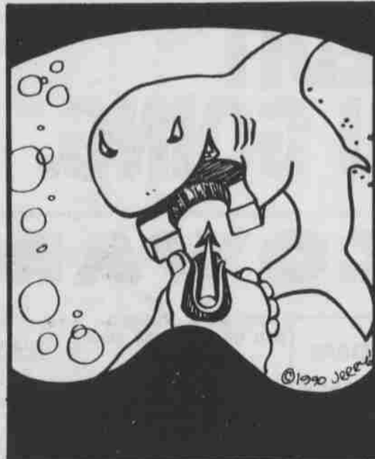
For one thing, he was definitely giving up seafood.