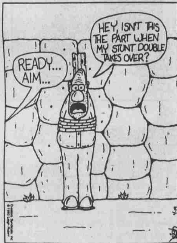
It could be said that some people spend too much time watching television.