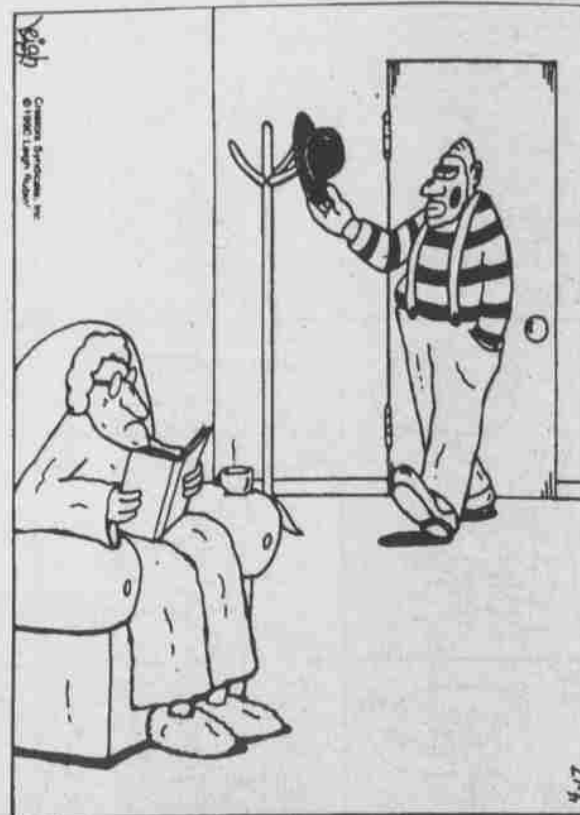
The mime's wife had long since given up asking how her husband's day had been. It was always the same answer... "Nothing much to speak of."