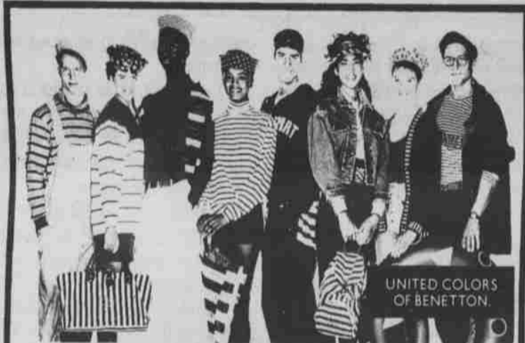
UNITED COLORS OF BENETTON. SPRING COLORS OF BENETTON.