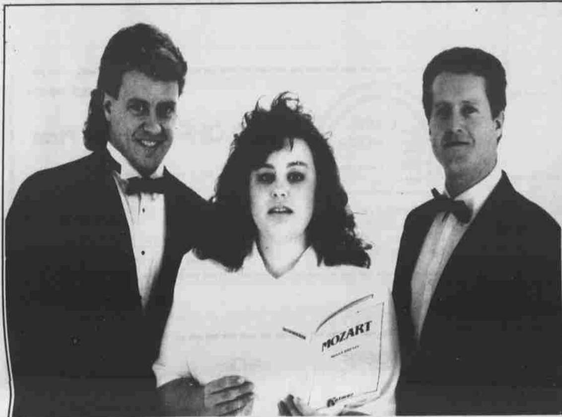
Springing into song- the UNLV oratorio chorus will present their spring concert April 1st. The concert is free.

The U.S. Recording Companies fund in part the instrumental music for this performance as approved by Local 369, American Federation of Musicians. For information call the UNLV Performing Arts Box Office, 739-3801.