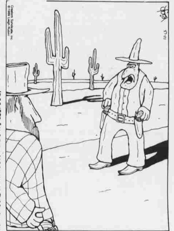
"So, you think I'm a coward, huh? ... I dare ya to turn around and say that!"