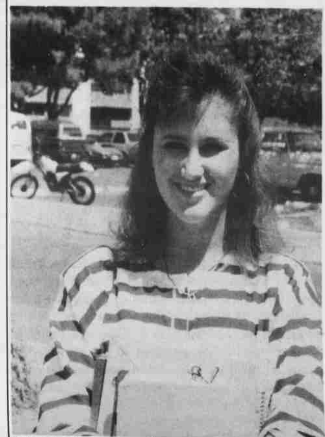
I thought they were really modern. I don't think there No, not really. They should have been thinking about get- Not really, it doesn't look like it belongs on a campus. was anything wrong with them.

Do you think the neon on the dorms was appropriate for a college environment?