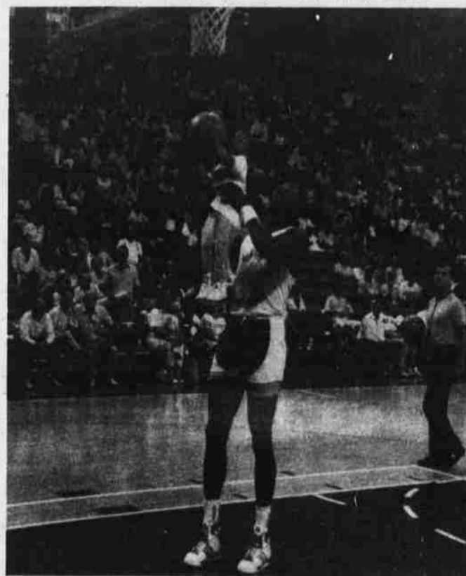
New York Knicks center Patrick Ewing gives an assist to a young fan