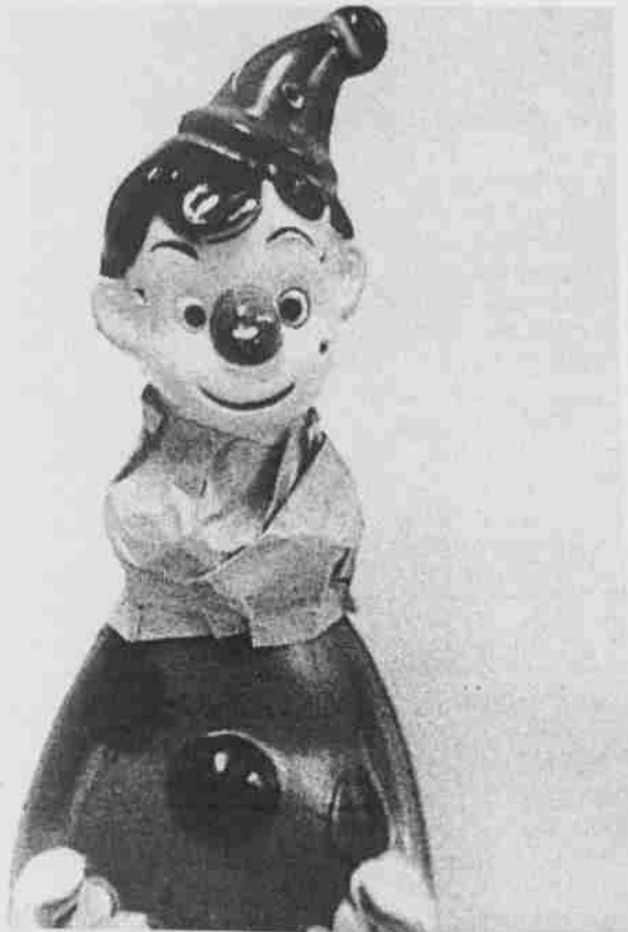
Bippy revealed, can you stand it!!!