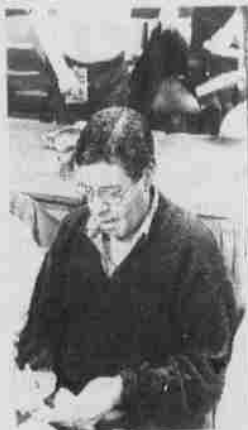
FAMOUS REBEL FAN — Jerry Lewis joins our continuing series of celebrities seen enjoying the games.

HOLIDAY CORPORATION The Leader in Hospitality