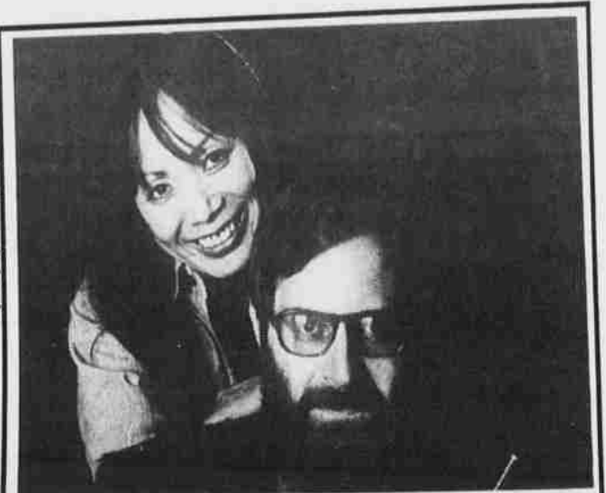
JAZZ ORCHESTRA — Toshiko Akiyoshi and Lew Tabackin will play the Judy Bailey Theatre, Feb. 22