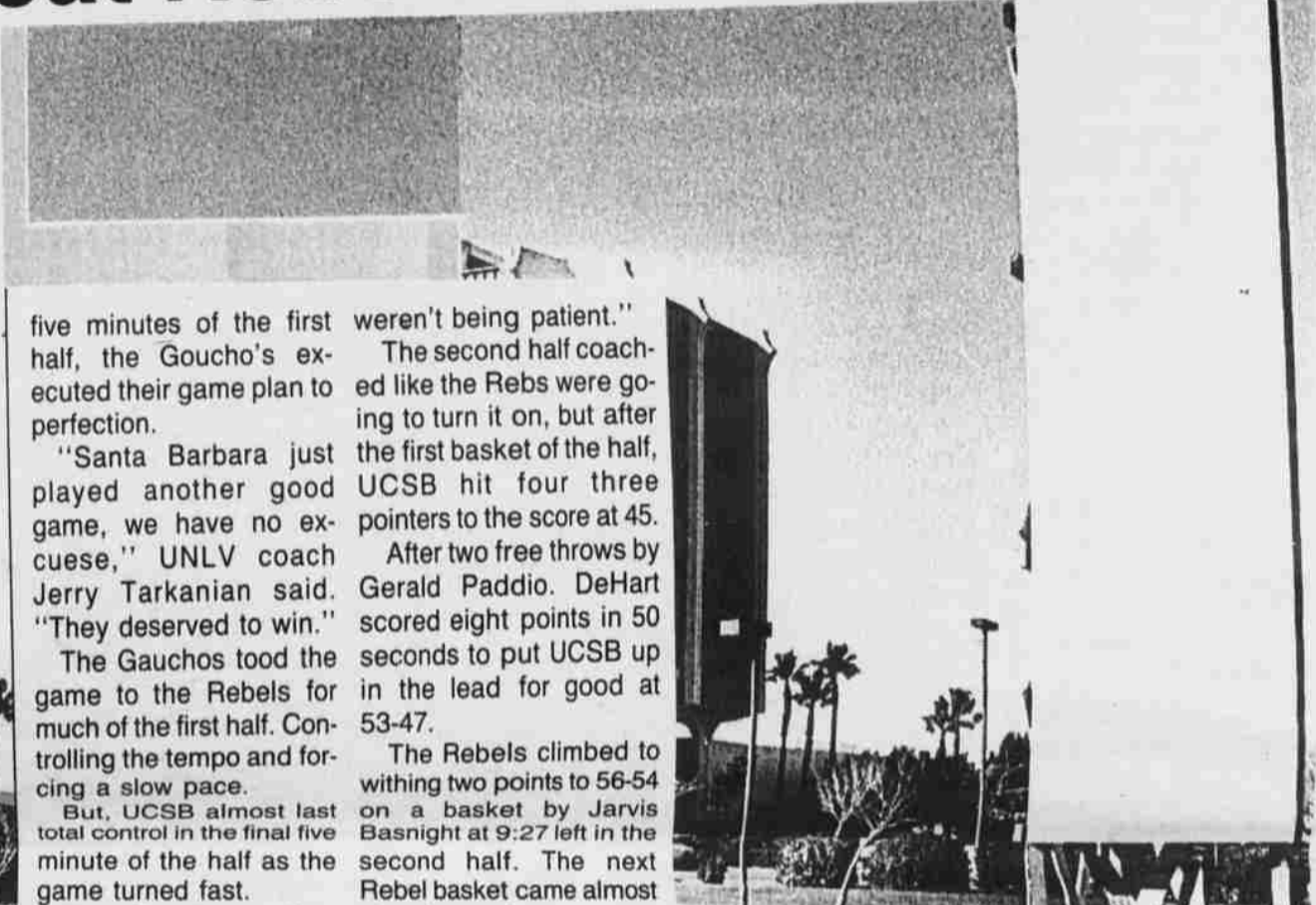
NOW YOU DON'T — a sign proclaiming a Rebel victory is a little premature.